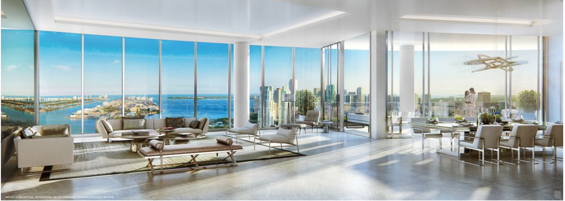
ARTIST CONCEPTUAL RENDERING. DEVELOPER MAY CHANGE WITHOUT NOTICE.