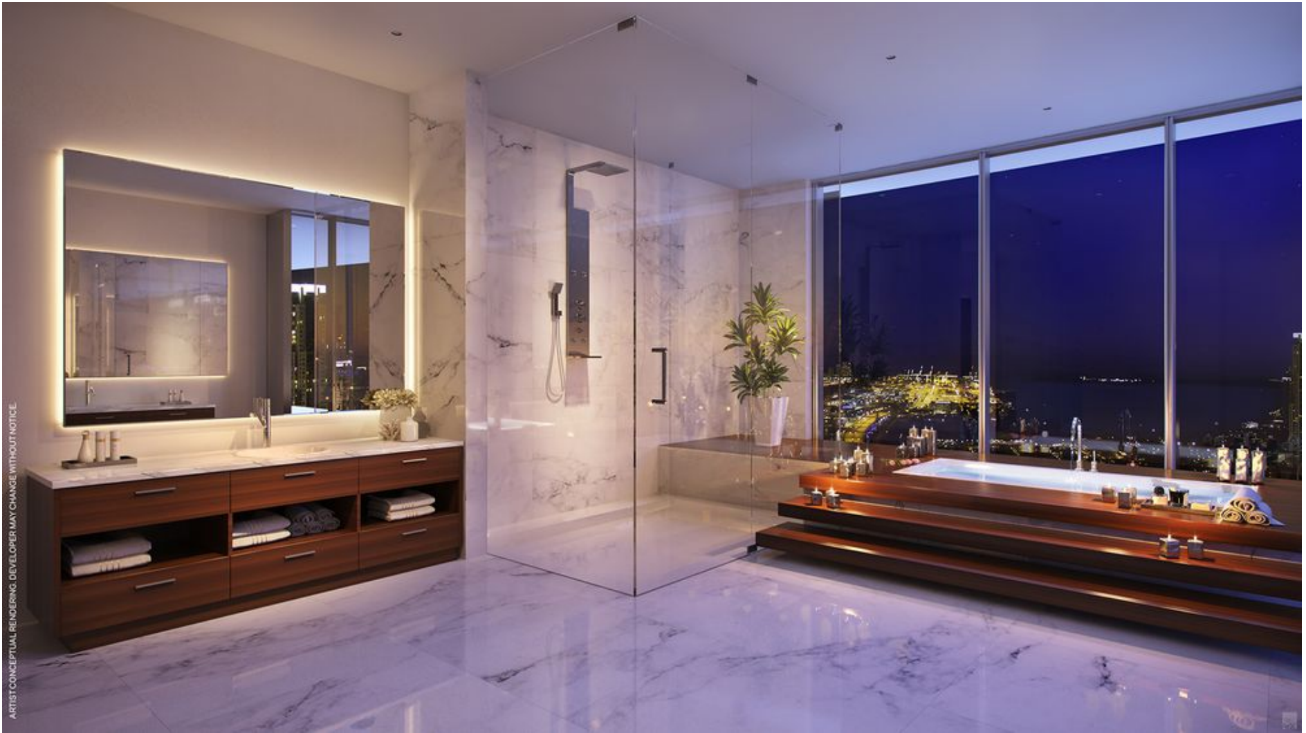
ARTIST CONCEPTUAL RENDERING. DEVELOPER MAY CHANGE WITHOUT NOTICE.