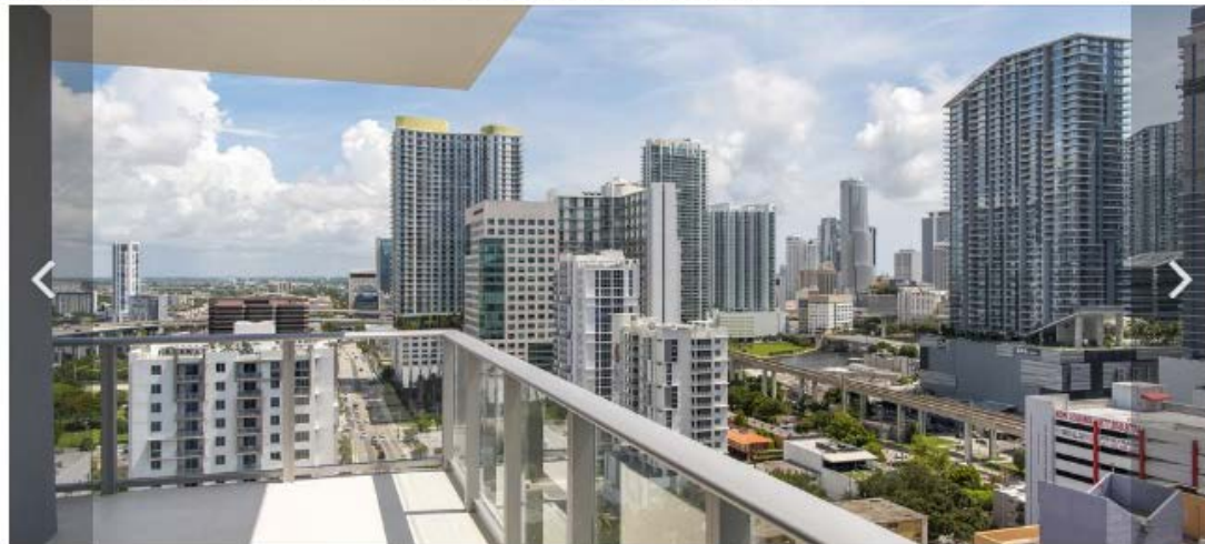
The kitchen area of a two-bedroom condo at Brickell 10.