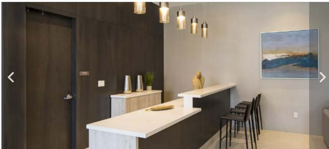
The lounge area just off the main pool deck at Brickell 10.