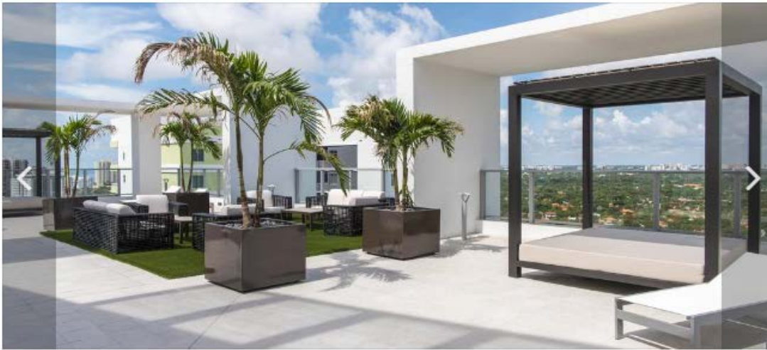
The rooftop sun deck.