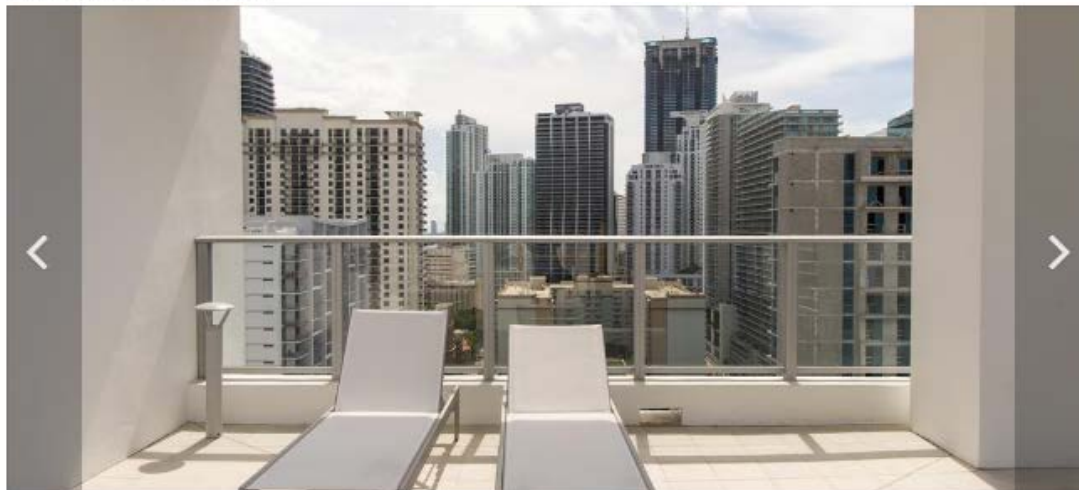
The rooftop sun deck.