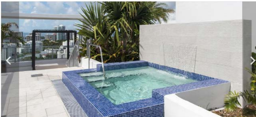
One of the cabanas on the rooftop amenities deck.