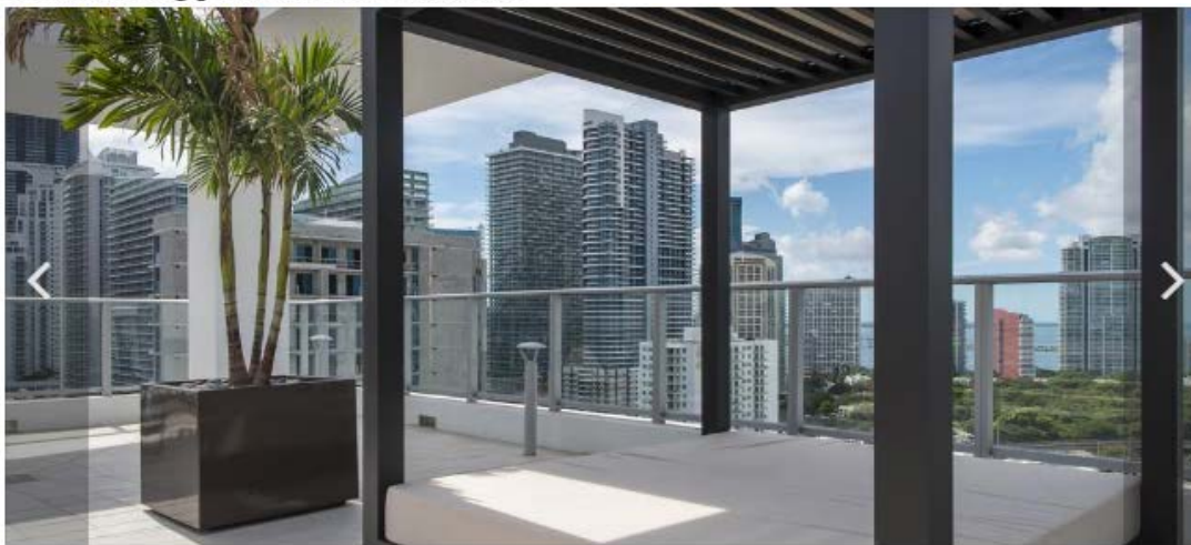
The reflecting pool and view of Miami.